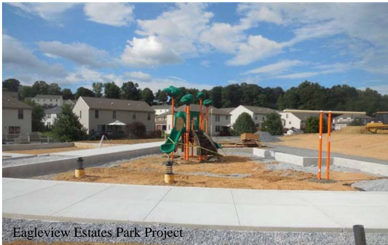
Eagleview Estates Park Project

Although the season for spending time outside is coming to a close the Township wants to keep residents informed about the park & recreation areas within the Township.