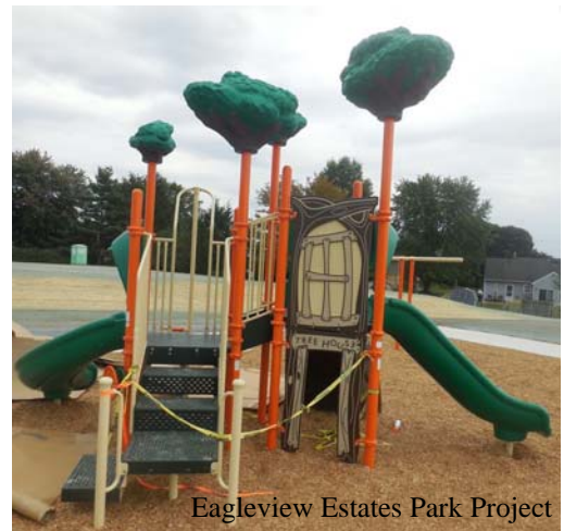
Eagleview Estates Park Project